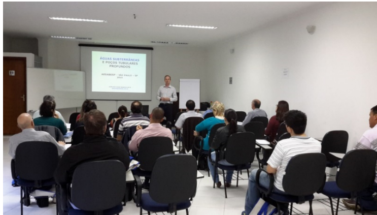
Underground Water Exploration Deep Tubular Well