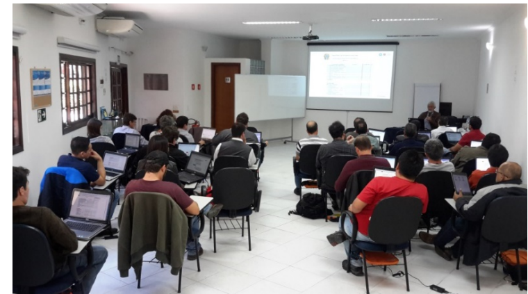
Dams Inspection and Safety