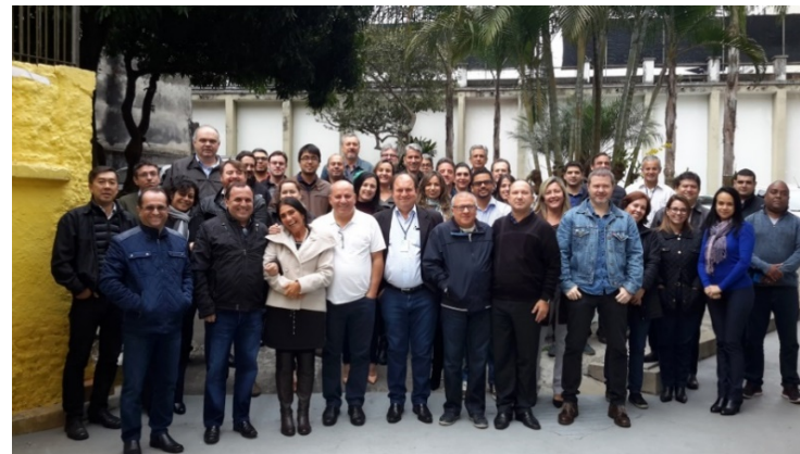
State Law - New bidding and contracting regime